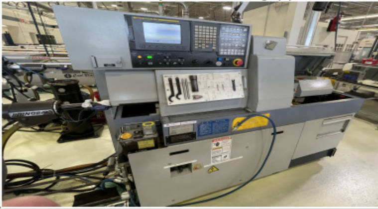
2011 STAR SR-10J Type C, 5 Axis, C-Axis, Sub-Spindle, FANUC 18i-TB, Rotary Guide Bushing, (2) Availale