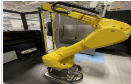
2019 Fanuc M-20iB/25 6 Axis Industrial Robot. Also: 2018 Fanuc LR Mate 200iD Robot Available