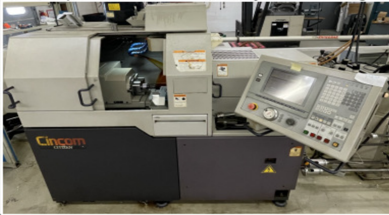
2004 Citizen L20 VIII Swiss Type Lathe, 5 Axis, C-Axis Sub-Spindle, Cincom Cont., Rotary Guide Bushing